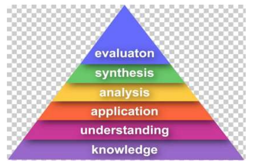
Figure: Bloom's Taxonomy

Bloom's Taxonomy is categorized into Knowledge, Comprehension, Application, Analysis, Synthesis, Evaluation